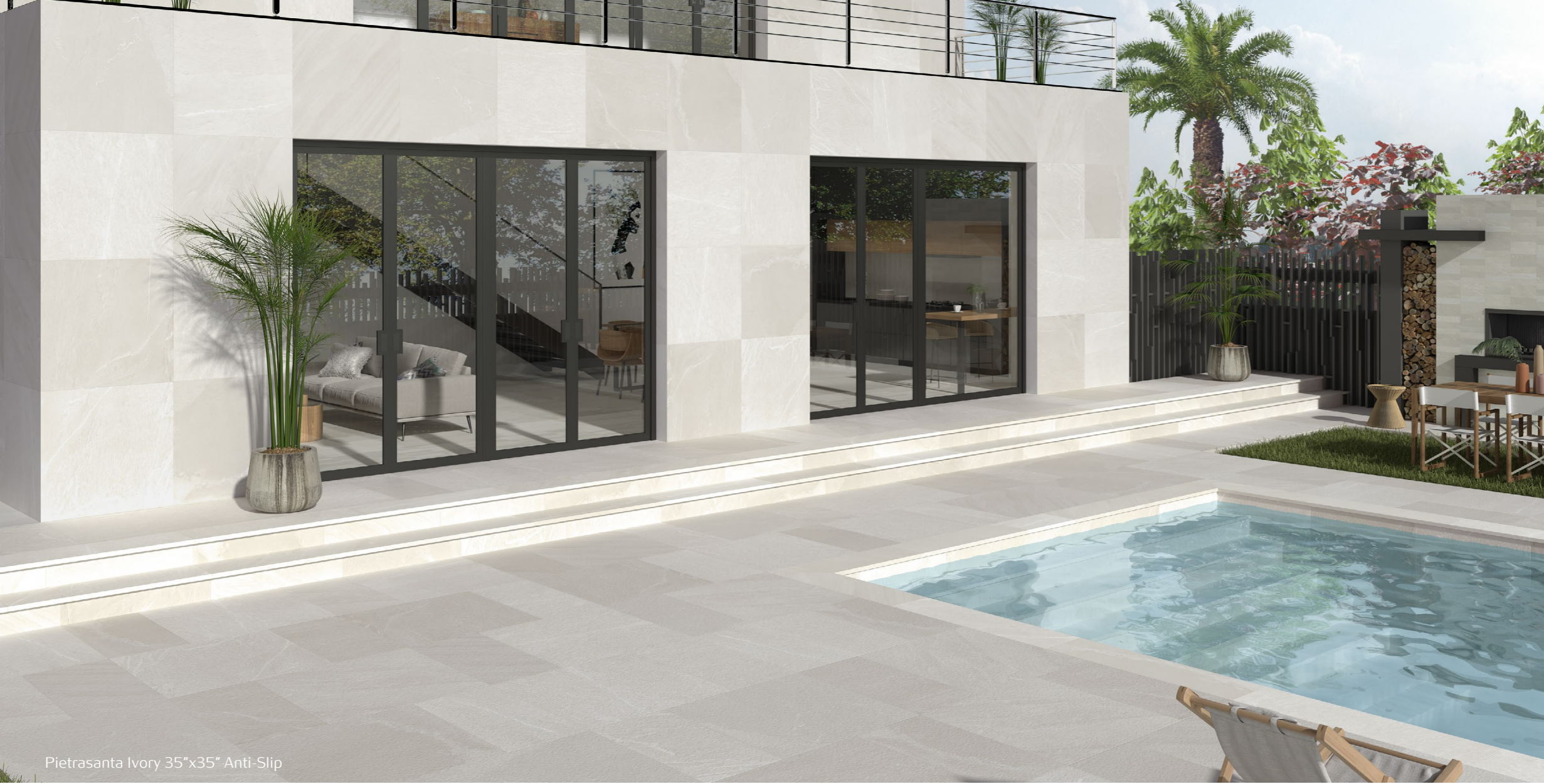
Pietrasanta Ivory 35"x35" Anti-Slip