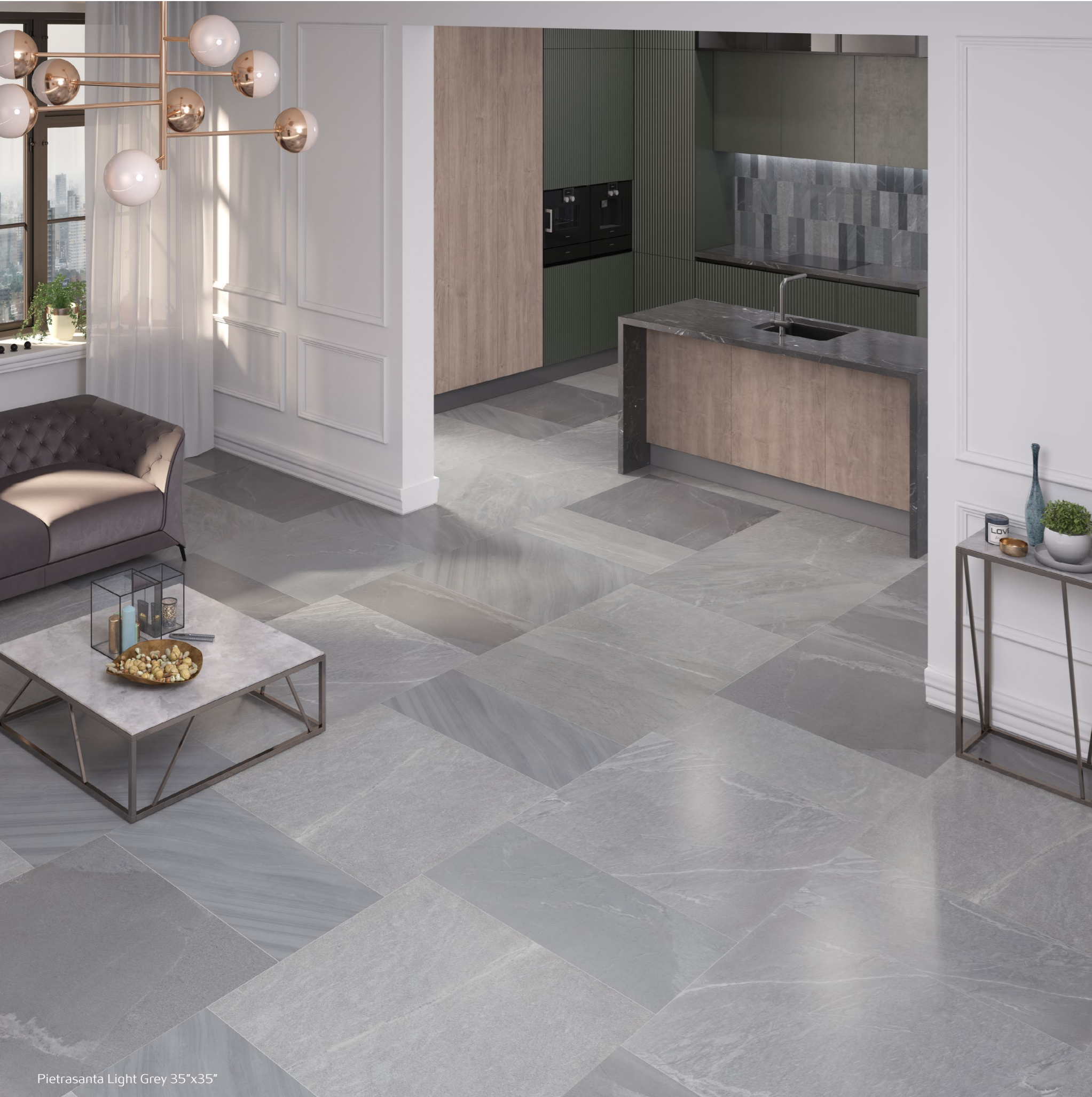
Pietrasanta Light Grey 35"x35"

Tradition and history blend to create the new Pietrasanta collection, inspired by the genuine Cardoso stone. The richness of this tiles collection is, undoubtedly, its graphic and chromatic variety, produced by a careful selection of Cardoso stone blocks with very different tonalities and grains.