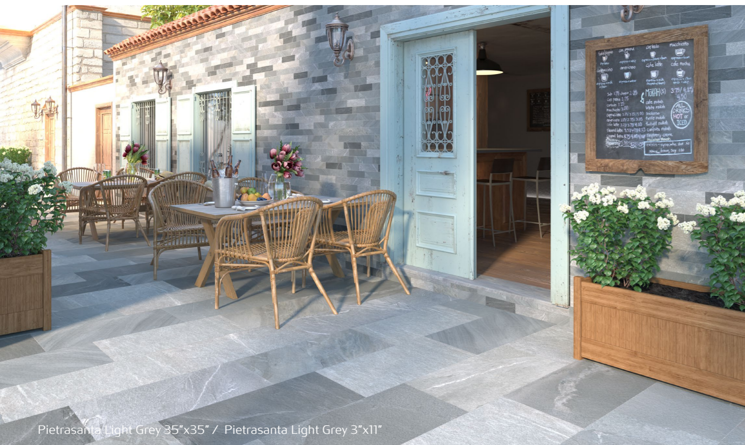
Pietrasanta Light Grey 35"x35" / Pietrasanta Light Grey 3"x11"