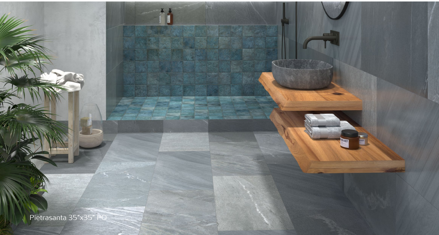
Pietrasanta 35"x35" PO