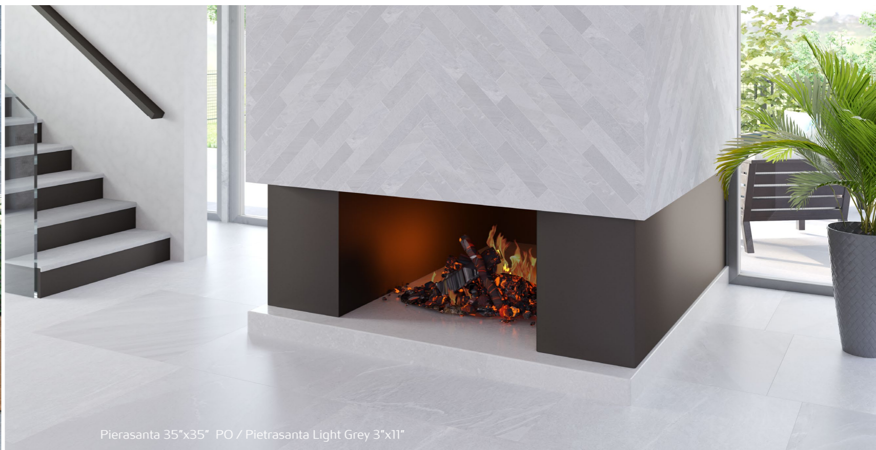
Pierasanta 35"x35" PO / Pietrasanta Light Grey 3"x11"